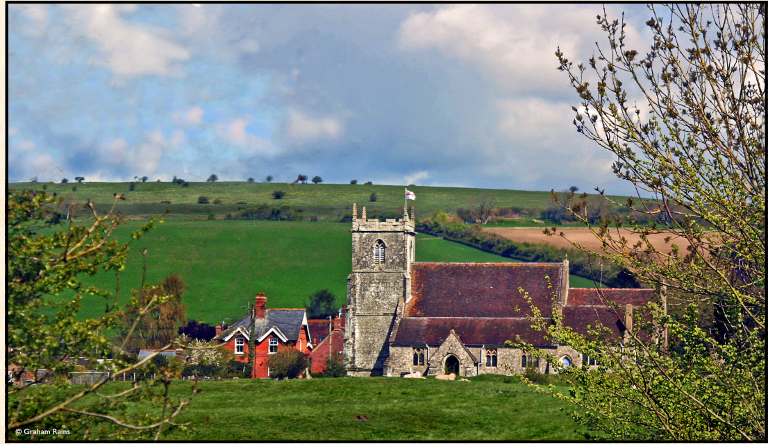
The Church of St. Nicholas, the parish church of Durweston. (above)