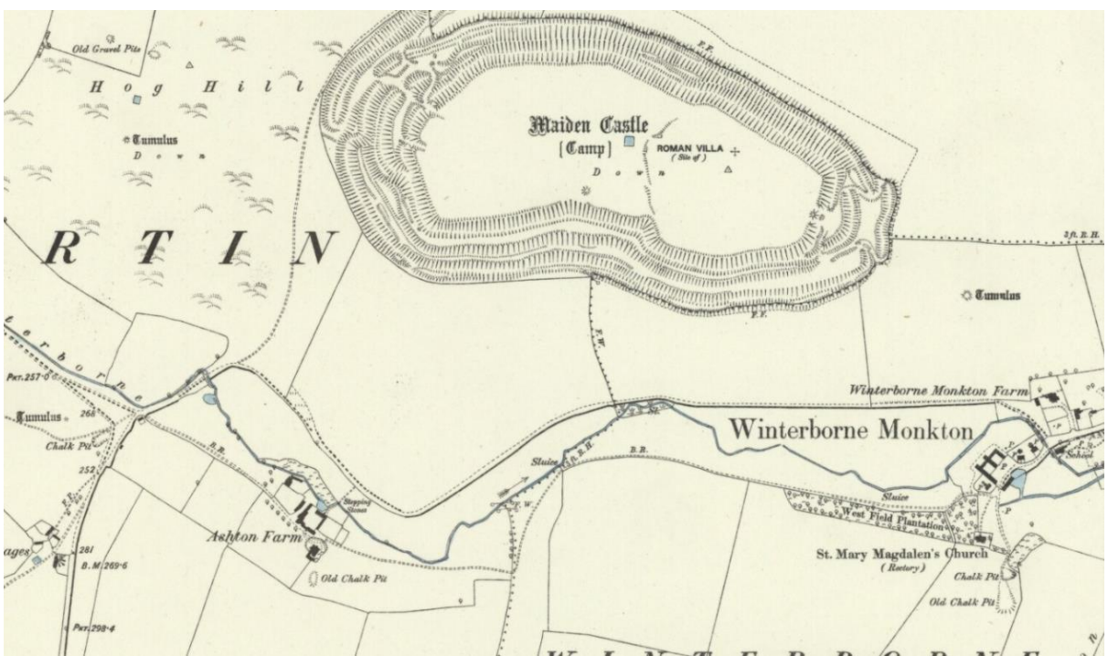
Extract from 1888 Map prior to this the settlement was concentrated on the south side of the water course.

Maiden Castle is situated north west of the village in the neighbouring parish of Winterborne St Martin and part of the hill fort lies on the site of a Neolithic causewayed enclosure and bank barrow covering two distinct knolls with concentric banks and outer ditches.