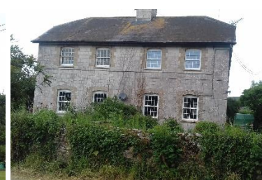
Manor Cottages leading to the Farmhouse right and yard below.