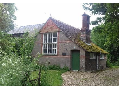
The School House and The Arts & Crafts inspired Ellworthy Church Village Hall with bellcote and chimney.