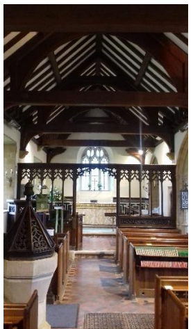
The Parish Church of St Simon and St Jude.

A turnpike road was established from Dorchester to Weymouth in 1761 and the parish of Winterborne Monkton had a turnpike (Toll-gate cottage) demolished in 1964 as part of a road widening scheme. On the 1851 census the enumerator recorded that the area covered the two parishes of Winterborne Monkton and Winterborne Herringstone, including Monkton Turnpike.