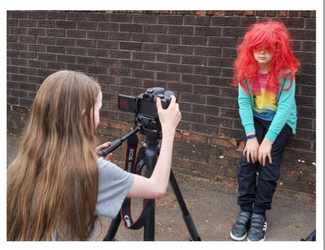
30 youth led projects share in £2.2 million of Young Start funding

Projects helping thousands of young Scots to explore their creative talents are